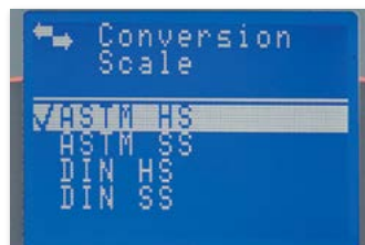
Conversion scales tables