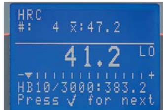
Results, average and conversion