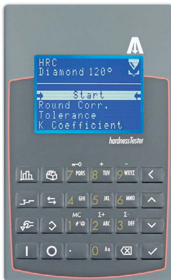
Touch key pad board IP 64 protection

Data output via RS 232 C for connection to printer and computer for diagram plotting and statistics. Hyperterminal is needed. Available USB adapter.