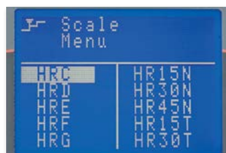
Set of the hardness test methods

The AFFRI software controls the whole instrument during the entire cycle avoiding human errors. The tester can easily be used by operator of every level.